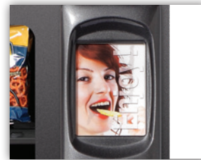
Back lighted point of sale window for advertising and specials.