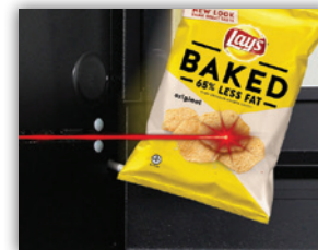
iVend® Guaranteed Delivery System

Keeps customers satisfied and reduces service calls for misloaded product.