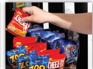
Dispenses All Brand Name Products

Keeps customers satisfied and reduces service calls for misloaded product.