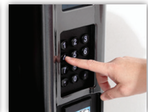
Large and easy to read selection buttons with Braille identification.