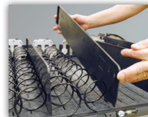
Re-configure trays to almost any package size in the field with no need for tools.