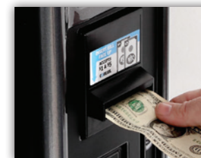
Premium Currency Acceptors

Keep your customers happy by with all their favorite chips, crackers, cookies, candy & confections.